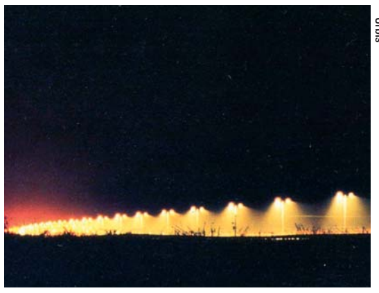
Full Cut Off lighting illuminate the road without lighting up the night sky

CPRE proposes that the Government should promote a public debate on the idea of a voluntary 'national switch off' for part of a night when there is a spectacular event in the heavens, such as a comet appearing at its brightest or a meteor shower. If all exterior lights were switched off between prearranged and extensively publicised hours, the nation could come together to gaze at the night sky. The switch-off could be cancelled if most of the country was covered in cloud on the night!