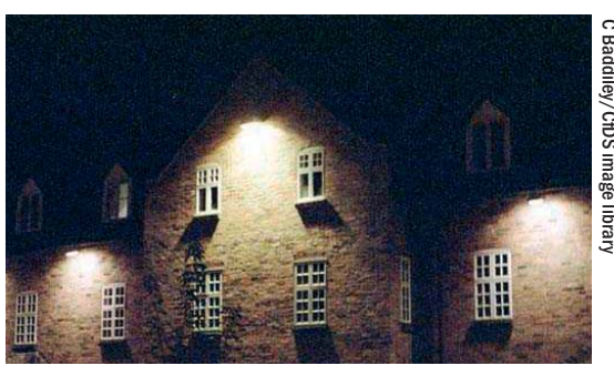
Well directed lights illuminate only the intended area

Set a target date for replacing all existing road lighting with low light pollution, 'Full Cut Off' lighting which cuts out all light going upwards.