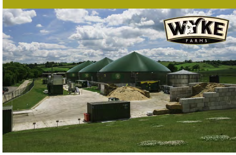
Anaerobic digester plant producing power to make cheese at Wyke Farms